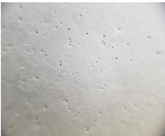
Competitive defoamer (high performances)

Comparison between defoamers on a standard self-levelling mortar at the same dosage