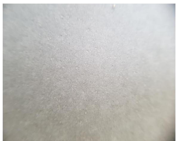
Antifoam PS 5